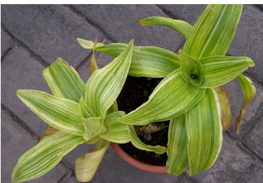
6" Hanging Basket for $6