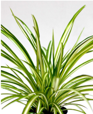
Spider Plants(variegated) 4" pot for $4 or 6" hanging basket for $6