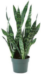
Tall Green 1-gallon pot for $10