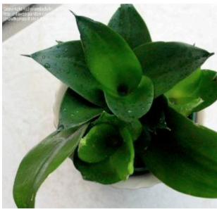
Birds Nest Green 4" pot for $5