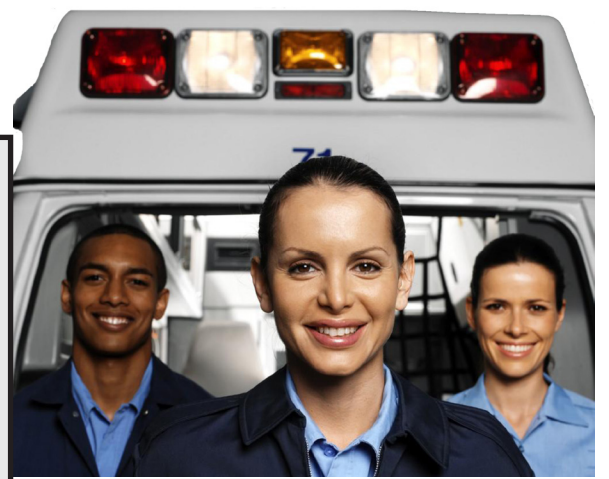
Refer to the FTCC website for the most current information. Go to www.faytechcc.edu and click on College Catalog.

*Note: The acceptance of transfer credit is ultimately up to the receiving institution. Where choices are available it is best to contact the institution you plan to attend to maximize your selection. See your advisor for assistance in selecting courses.