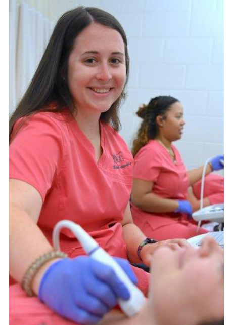
Work-Based Learning Option: NA

Students with a felony conviction may have limited licensure and employment opportunities.